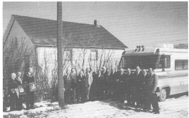
photo: The Calgary Contingent who traveled by Motor Home.

A delightful banquet, catered by the Local 4H group, followed with various toasts and replies wishing Berry Crocus No. 82 success.