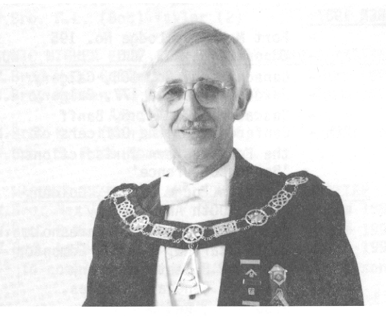
GRAND MASTER 1987/88

EDITOR'S NOTE: The full text of the address appears in the 1987 Grand Lodge Proceedings.