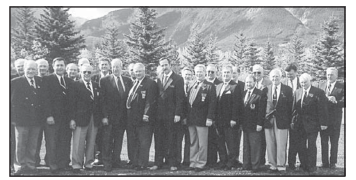
The men in attendance at the 1999 Western Conference.

To answer these questions first, it should be stated that this conference is, essentially, a "retreat" of the Grand Masters, Deputy Grand Masters, Senior and Junior Grand Wardens and Grand Secretaries (if they wish to attend) as Delegates to the conference of the Grand Lodges of Alberta, British Columbia, Manitoba and Saskatchewan. Observers are also welcome, and there is al-