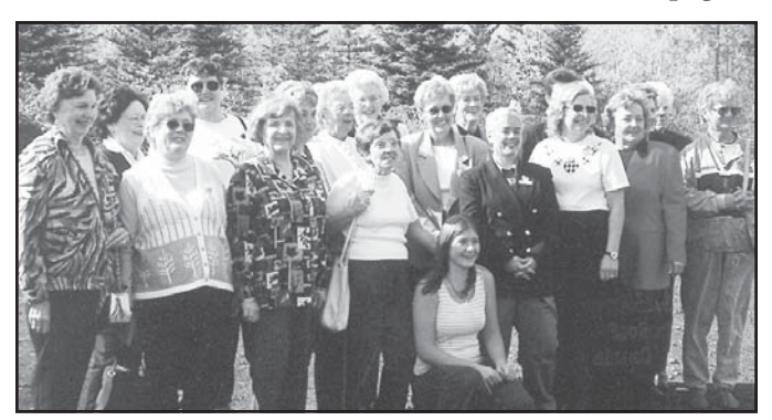
The ladies whose presence was so much appreciated.