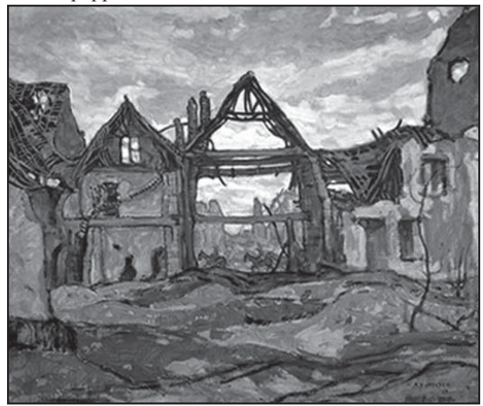
Houses of Ypres Painted in 1917 by A.Y. Jackson (1882–1974) CWM 8207.

Perhaps it is twilight for vet'rans, It comes to us all with the years, At least we have rich hallowed memories And poppies, and crosses, and tears.