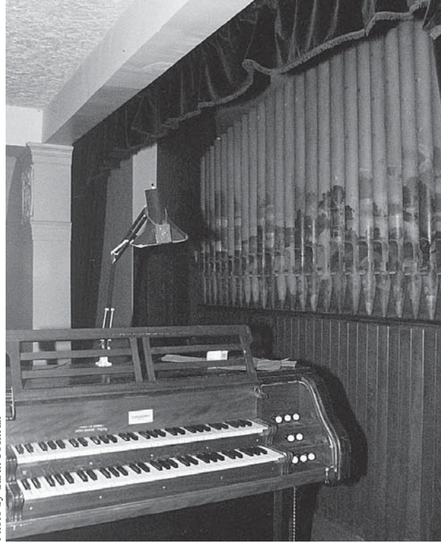
Casavant Opus 398, 1910 organ console with the organ case (the original packing case material) and display pipes which hide the actual organ in the chamber behind.

To tour this organ, one has to enter the gallery by a rather steep stairway. At the top of the stairs at the left, the visitor sees the display pipes. These are