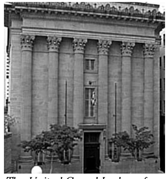
The United Grand Lodge of Queensland, in Brisbane, .

Our final stop was Sydney, the largest city in Australia and capital of New South Wales. We had noticed in our travels around Australia that it was not difficult to find the Grand Lodge buildings. Besides the names prominently on the buildings, the street signs pointing out the direction to the buildings, and the signs placed on the sidewalk alerting visitors to tour times, in Sydney (the Grand Lodge Building is on 279 CastlereaghStreet)they use very prominent signs to both identify the building and notify visitors that the museum is open to the public every day. The Sydney Masons are very entrepreneurial. The Grand Secretary, Bro McGlinn, informed