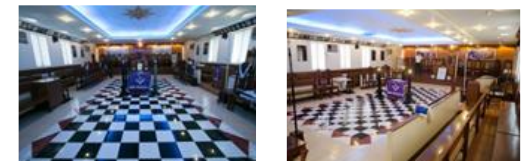
Isagani Lodge #96