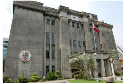
Rise of Freemasonry in the Philippines